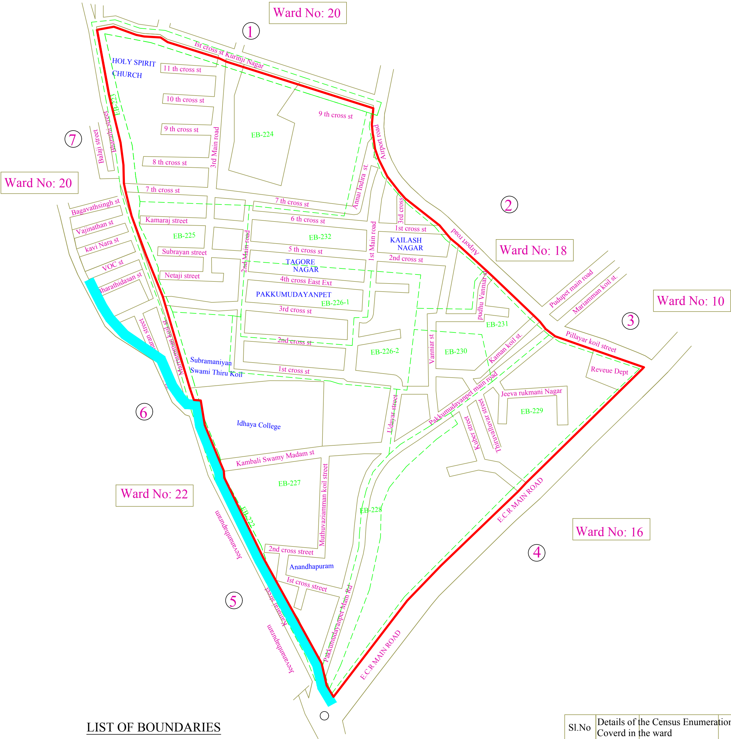
LIST OF BOUNDARIES