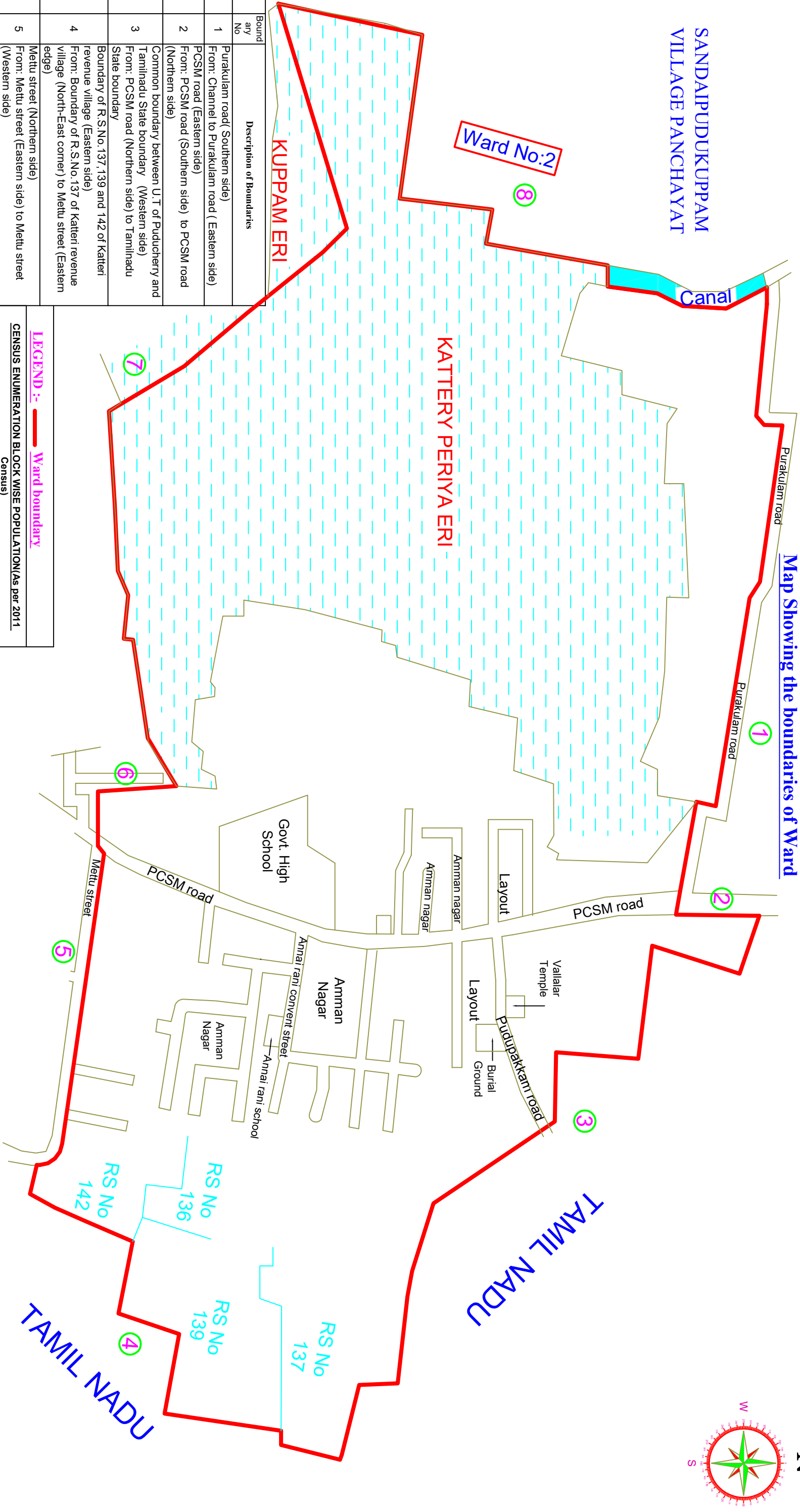
Map Showing the boundaries of Ward

Village Panchayat Ward No:1 Population (As per 2011 census): 715