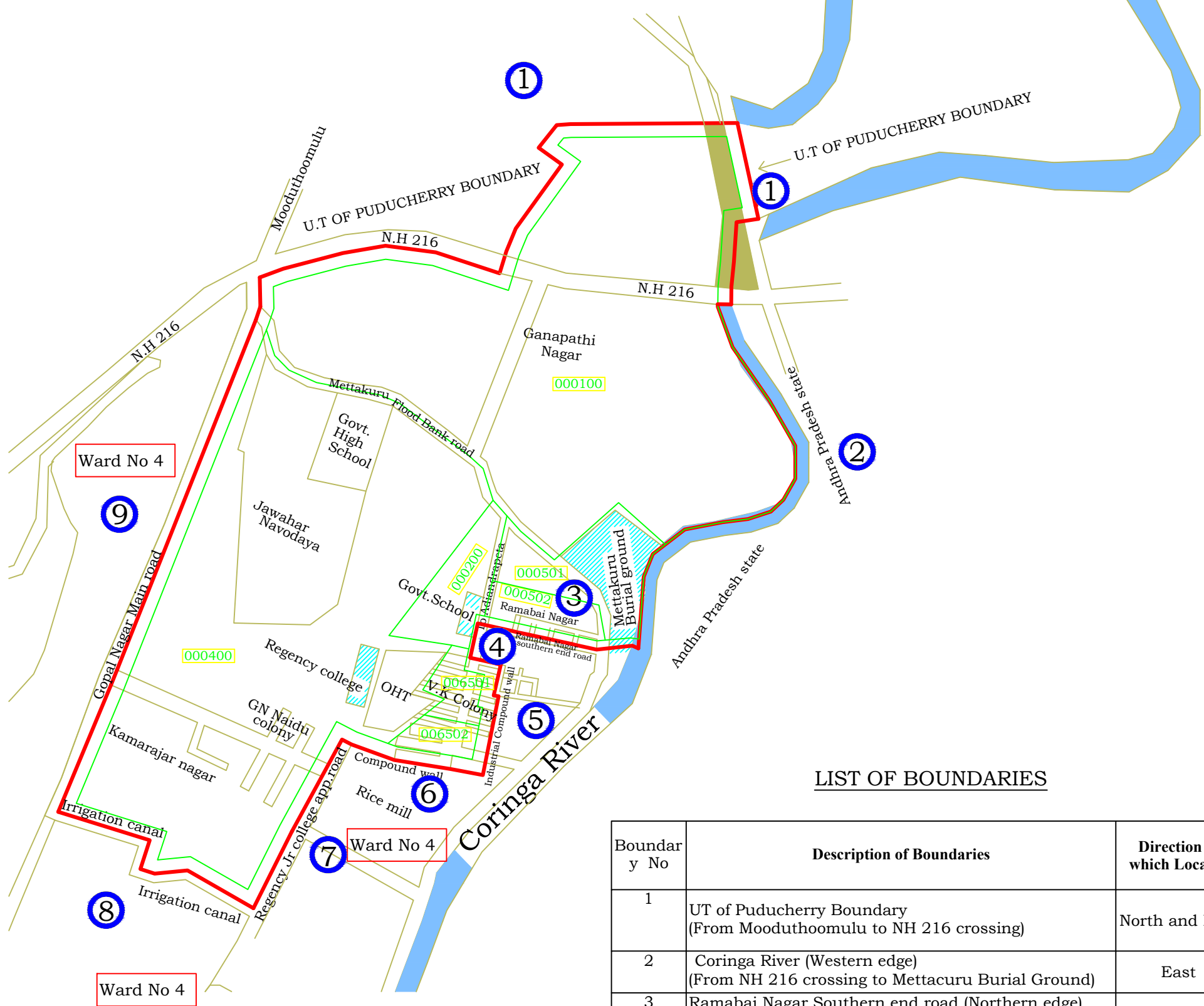
LIST OF BOUNDARIES