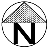
LIST OF WARD BOUNDARIES

DRAFT MAP SHOWING THE PROPOSED BOUNDRIES OF VILLAGE PANCHAYAT WARDS